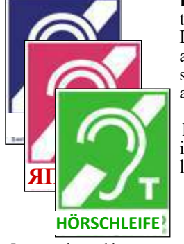
In any color and language, this sign tells you there is a hearing loop available.

Edinburgh Airport, Scotland - With their addition at 17 sites in the terminal, loops can be found at departure gate, baggage claim and both international and domestic arrivals areas and at such diverse locations as Starbucks.